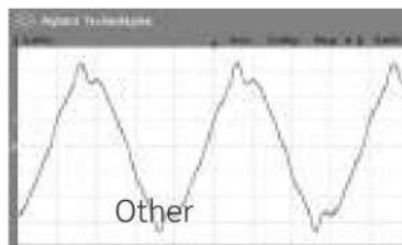
DISTORTED SINE WAVE OTHER BRANDS