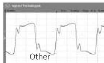
NEARLY SQUARE WAVE OTHER BRANDS

finike lithium Based Home UPS/Inverter provides Pure Sine Wave output, whereas output of Home UPS of other brands gets badly distorted especially on normal loads like Compact Fluorescent Lamp, Tube Lights, Motors, Coolers & Computers etc.. this type of Distorted Waveform is very Harmful for all your Sophisticated Electronic Appliances.